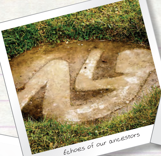
Echoes of our ancestors