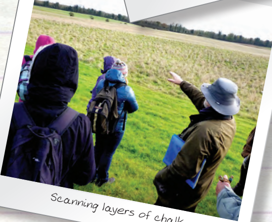
Scanning layers of chalk