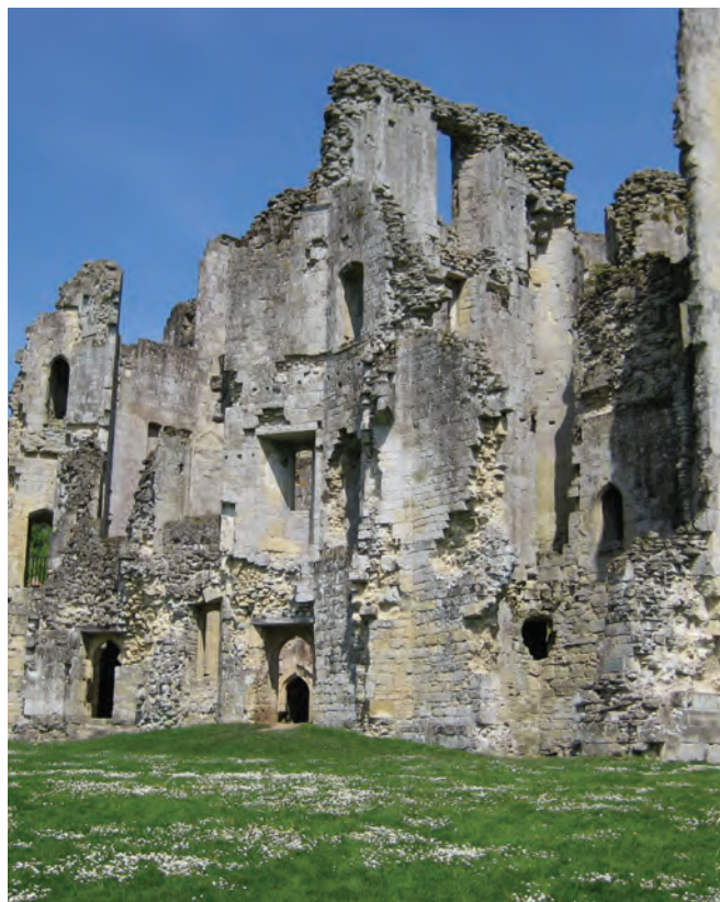
Old Waldour Castle - R Burden