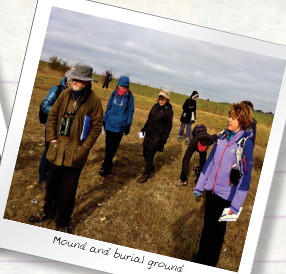
Mound and burial ground