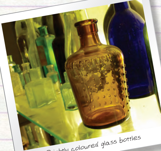
Brightly coloured glass bottles