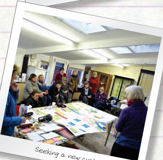
Seeking a new cycle.