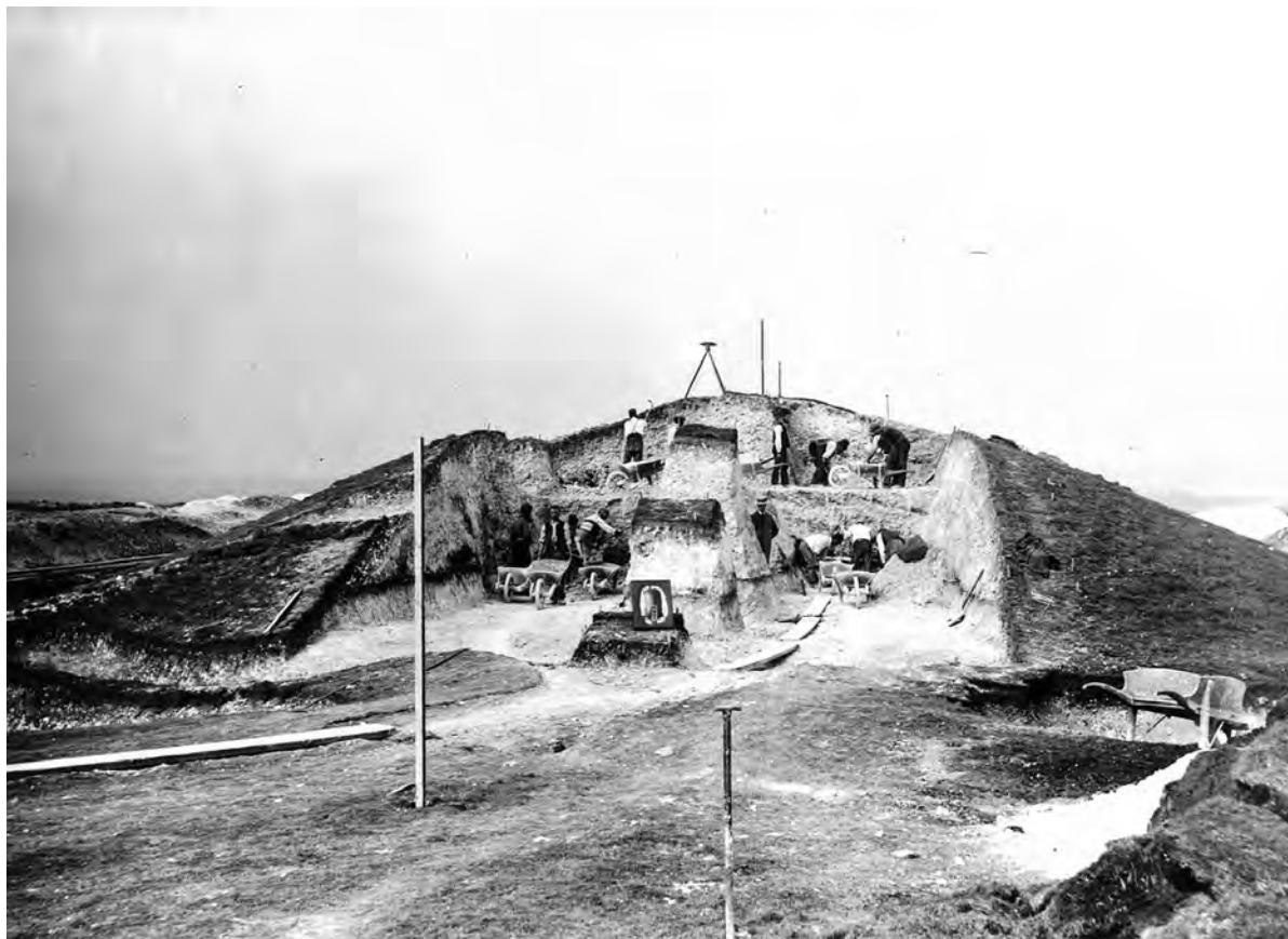
Wor Barrow excavations