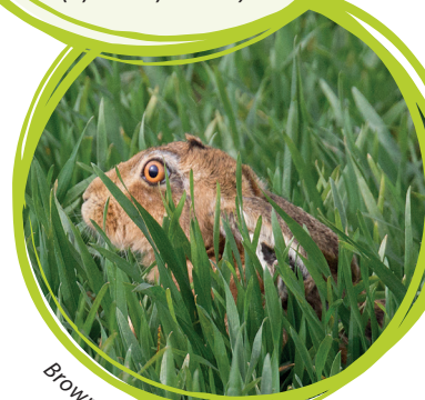
Brown Hare