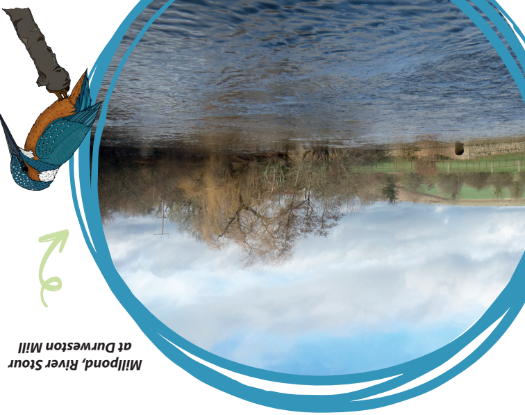
Millpond, River Stour at Durweston Mill

A Blandford Forum has been a fording point on the River Stour since Saxon Times, when it was recorded as Blaeu-y-portage and as Blaneford in the Domesday Book. By the 13th Century it had become a market town. In the 18th Century, the author Daniel Defoe is quoted as having expressed his view that ribbon trim made in the town was "the best bonelace in Britain..." In the 1700s and 1800s Blandford was a maling and blending focal point of some importance (source: Blandford Forum Town Council). B Durweston appeared in 1086 in the Domesday Book in which it was named as both Derwinstone and Derwinestone. There were 15 households recorded, and 2 acres (0.8 hectares) of vineyards.