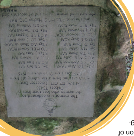
The Alirmen's Memorial