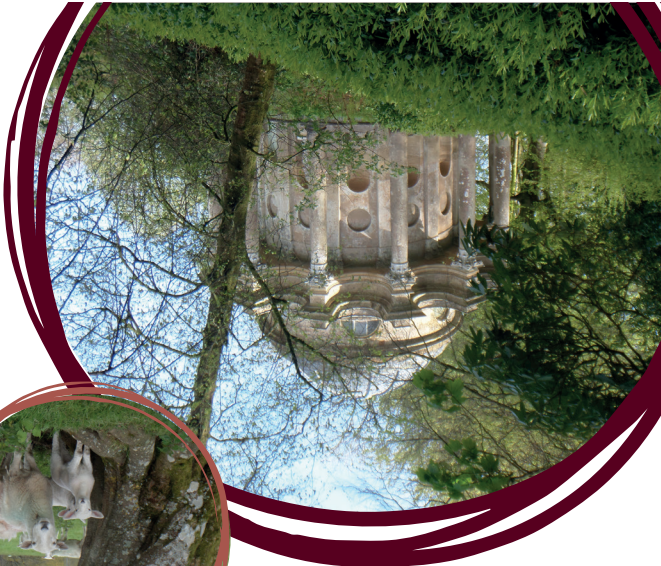
Temple of Apollo

Circular walk which explores forests and fields of the Stourhead Estate, taking in the village of Stourton and the hamlet of Gasper.