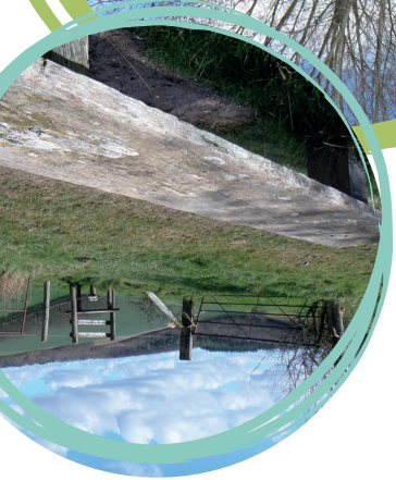
Salisbury Cathedral. The Hampshire Avon, close to River Nadder which itself flows into alone. At Wilton the Wylye joins the streams are found in Southern England