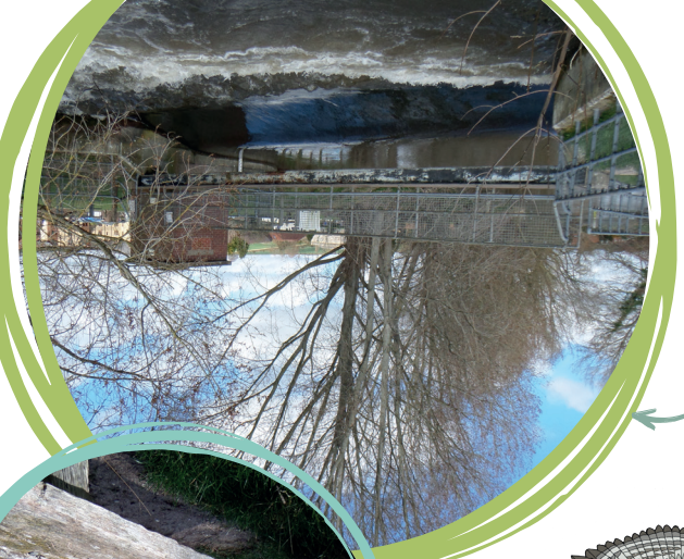
The River Wylye