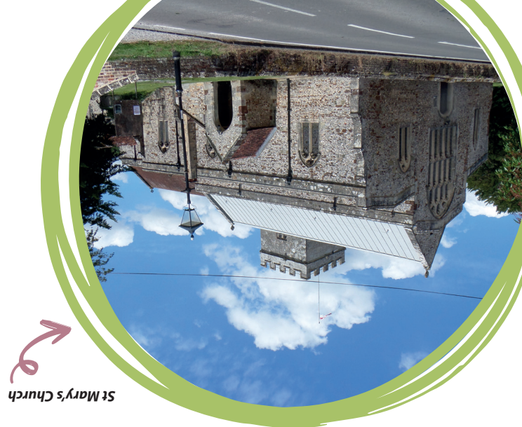
St Mary's Church