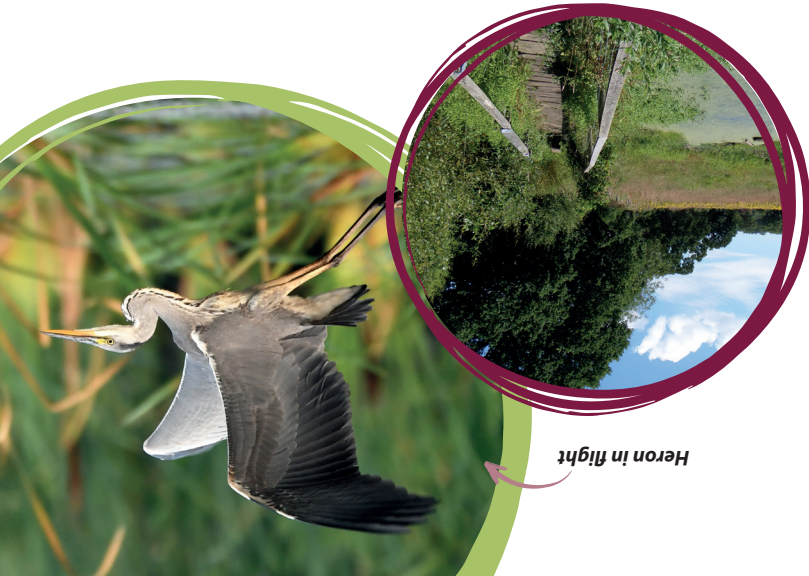
Heron in flight

Herony: Herons are often thought about as being solitary birds but from February through into April they come together to breed in a nesting site, called a Herony and containing as