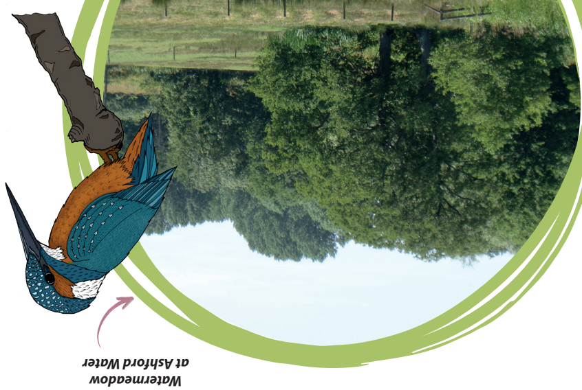
Watermeadow at Ashford Water

St. James' Church: A Grade 2 listed building, described in the book 'The Buildings of England, Dorset' by John Newman and Nikolaus Pevsner as "a very simple and unusual church"; The Allen River, joined by Ashford Water just to the east of Alderholt Mill, is a chalk stream which has its source between the villages of Martin and Tidpit within the Cranborne Chase Area of Outstanding Natural Beauty and runs in a south-westerly direction for about 13 miles to meet the River Avon at Fordingbridge. Although much of the crystal clear water is quite shallow, it also has numerous deep pools that make it a habitat for trout. Coarse fishing is available at Alderholt Mill from June to March.