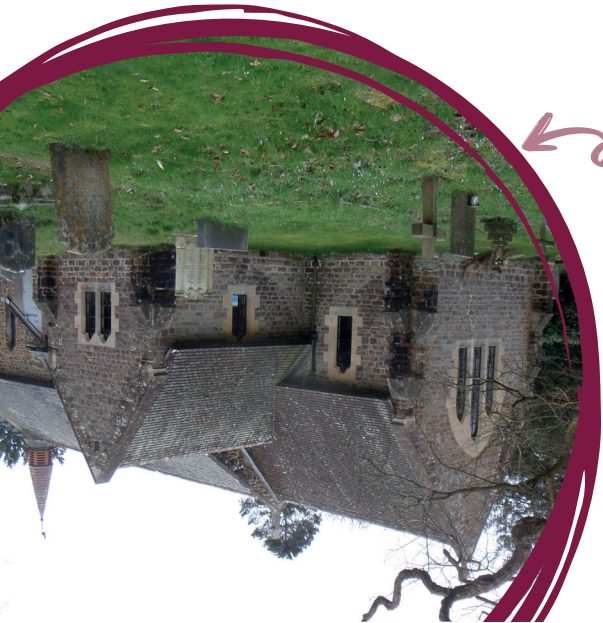
St James' Church

Alderholt Mill. There has been a mill here since the 14th century. Until 1947 it was worked commercially, after which it fell into disuse before being restored and made able to produce flour again in 1987. The mill still has a working water wheel which uses the power of the river to grind wheat, from which wholemeal flour is made that can be purchased at the mill and from other local outlets. A self-catering flat at the mill is available for weekly rental from May until November.