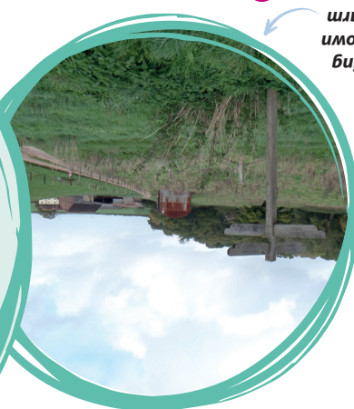
King Down Farm

(E) All Fools Lane. An ancient trackway, it is thought that the original name was All Souls' Lane but became corrupted by an error of transcription at some time in its history when the 'S' was mistaken for an 'F'.